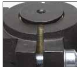
breakaway hub prevents gearbox damage