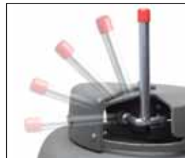
simple manual release