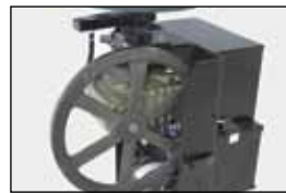
steel frame belt driven