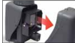
easy access case design